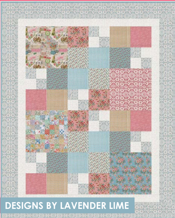
DESIGNS BY LAVENDER LIME