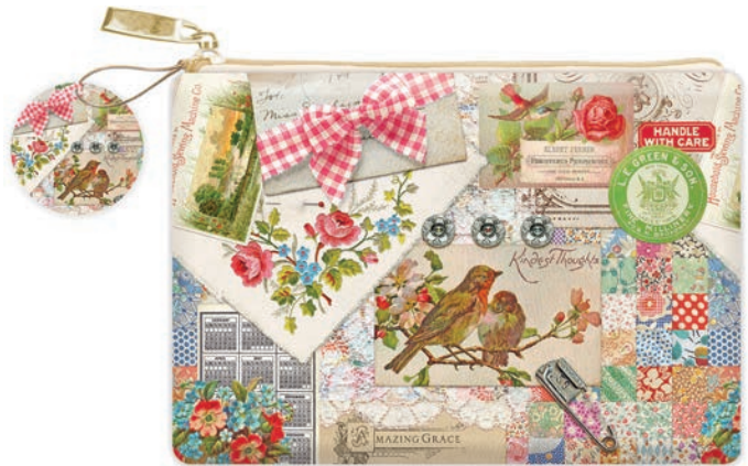
1005 48 MUL 6 Glam Bag Collage