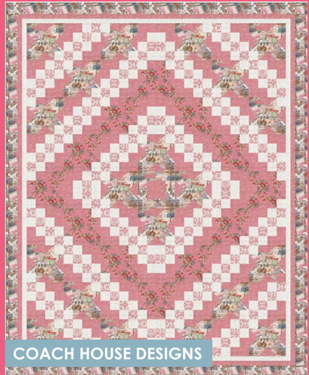
COACH HOUSE DESIGNS