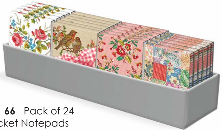
1001 66 Pack of 24 Pocket Notepads