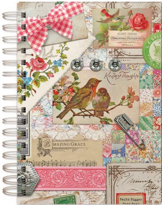
1001 67 MUL 4 Wire O Journal